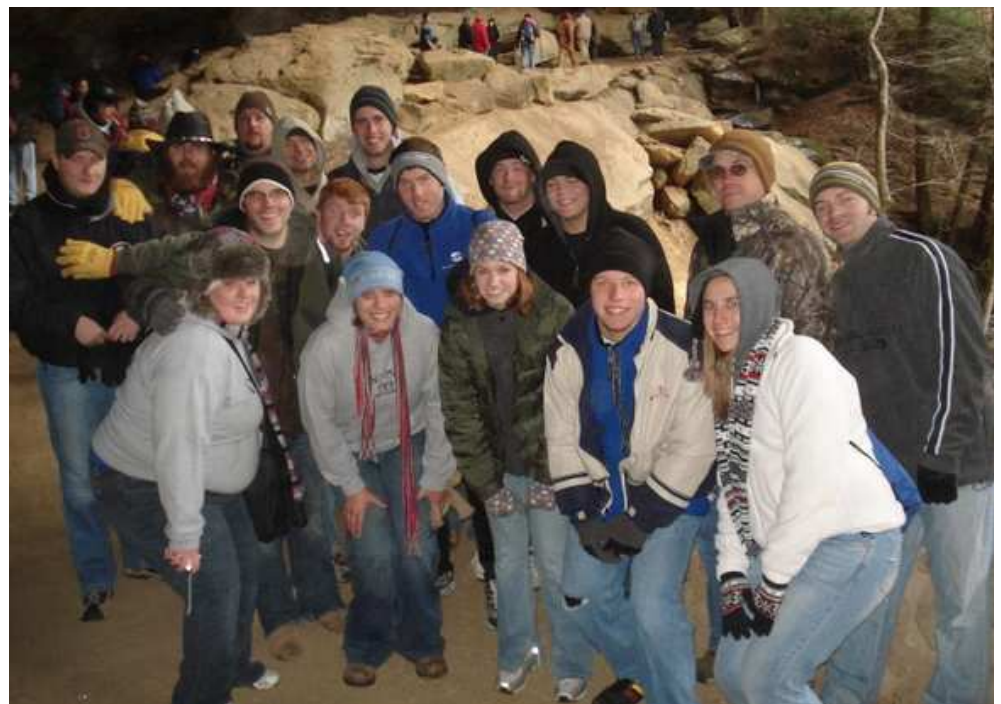
Hocking Hills Winter Hike